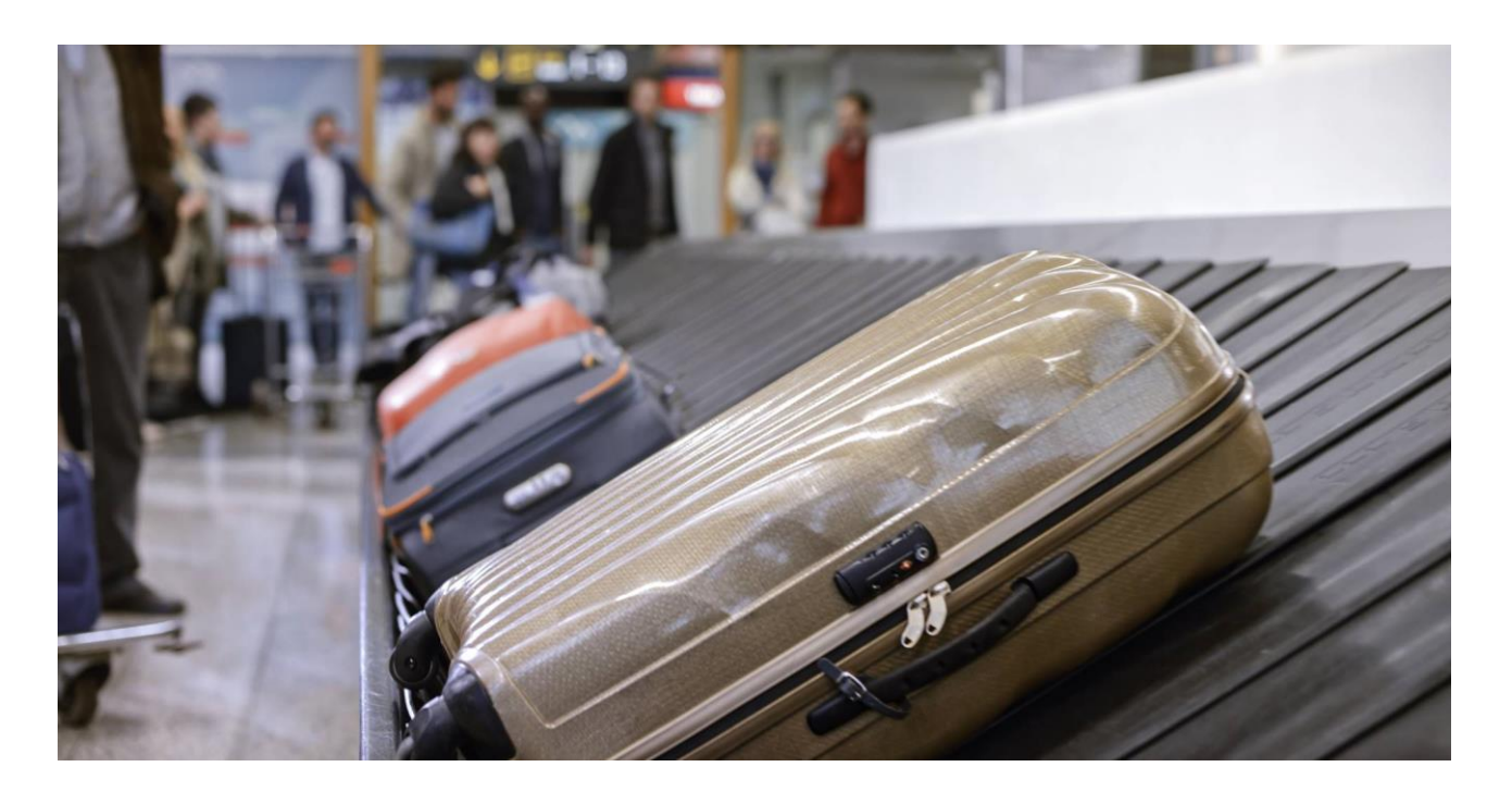
Guidance Document for Airlines